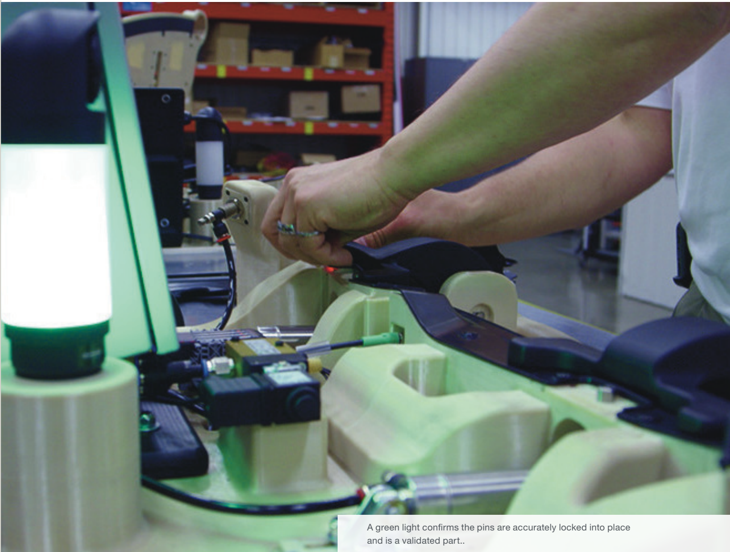
A green light confirms the pins are accurately locked into place and is a validated part..

Stratasys 3D printing technology enabled Solaxis to continuously improve the jig, saving the customer production time and money. In turn, the automotive supplier has significantly increased the reliability of the door seals it provides to its OEM customer. With zero compliance issues the last two years, that means higher profits for the company.