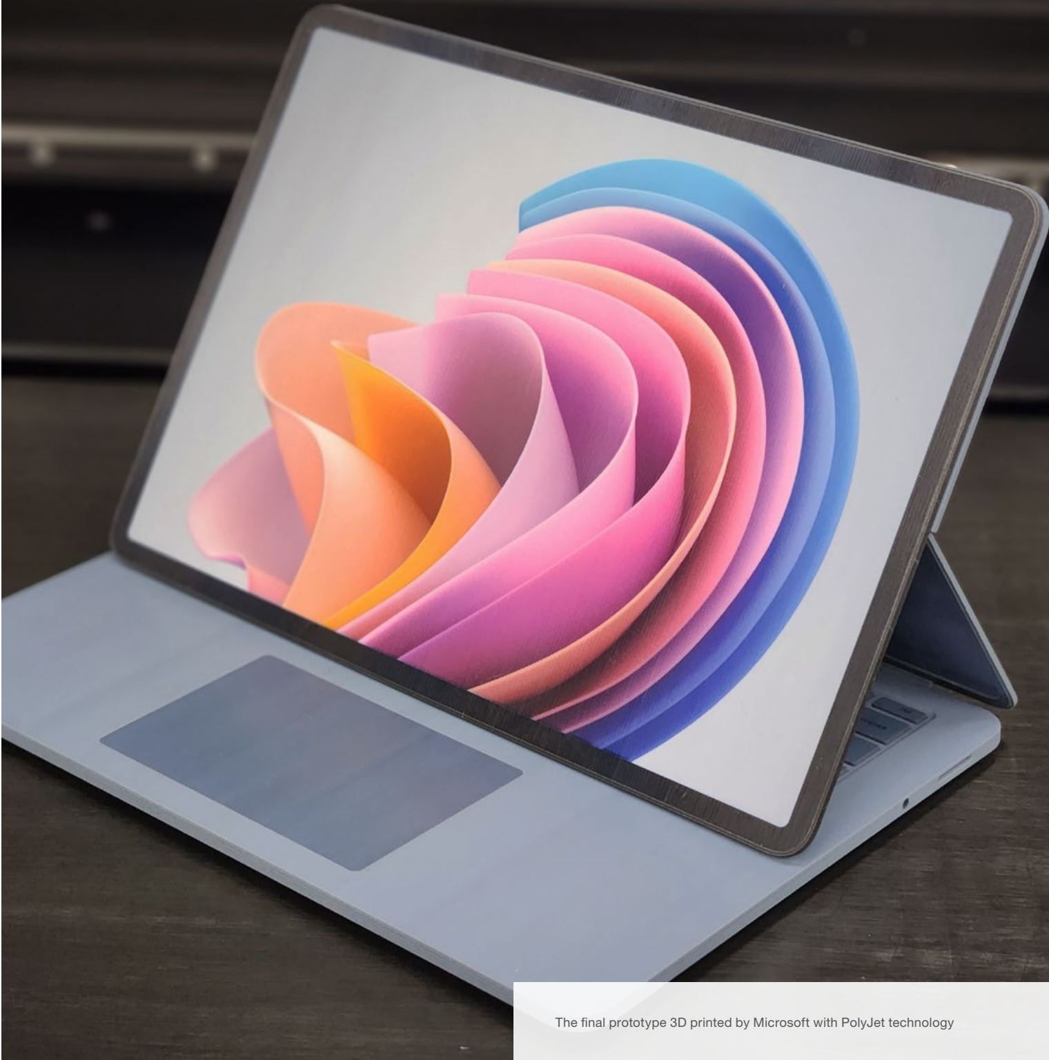
The final prototype 3D printed by Microsoft with PolyJet technology