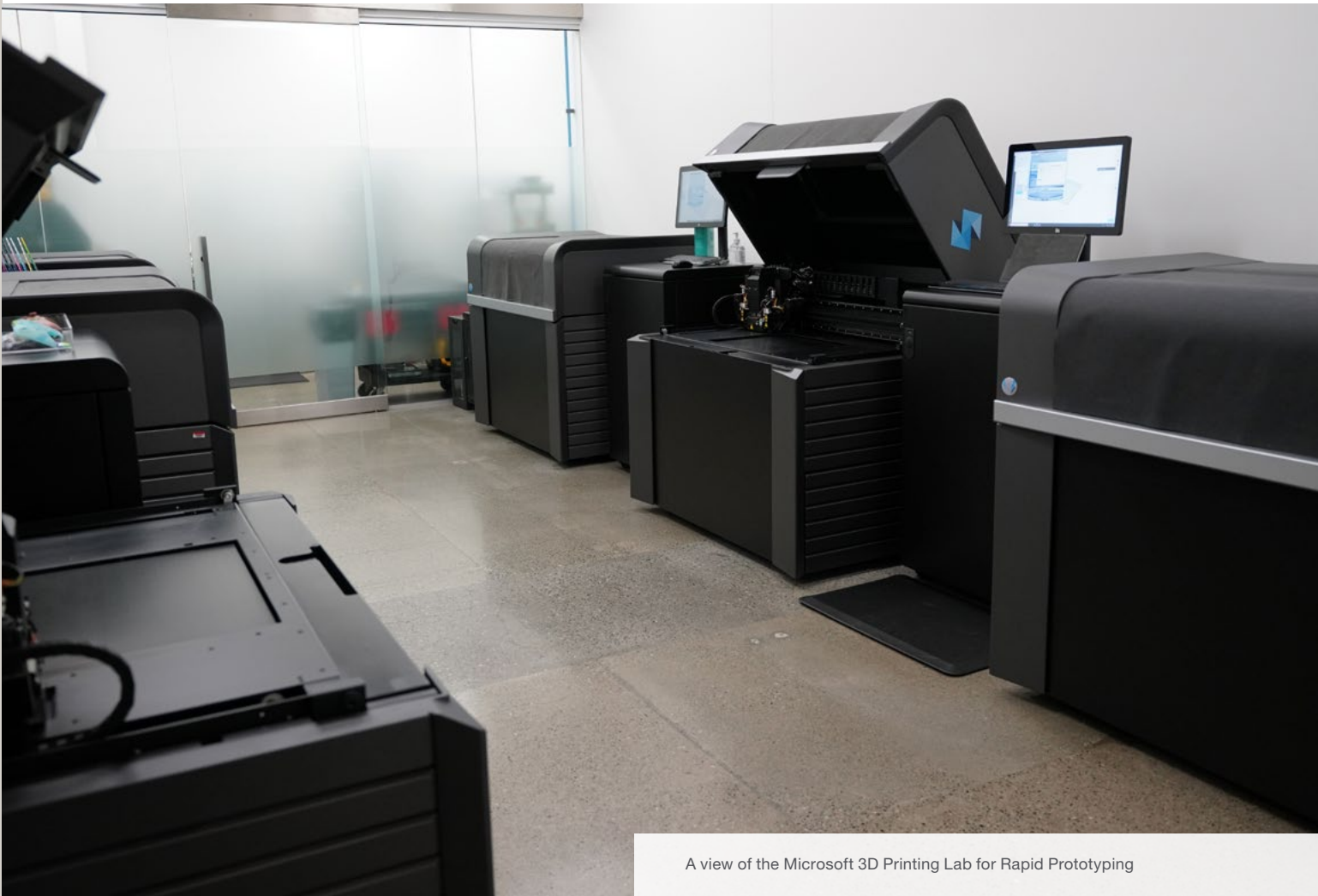
A view of the Microsoft 3D Printing Lab for Rapid Prototyping

The question is and always will be “how do we innovate faster?” Fueled by consumer demand and industry competition, hardware development cycles are continuously shortening. Product solutions, prototypes, and decisions need to be made at an accelerated pace to be competitive. In addition, product development increasingly demands higher accuracy to ensure design decisions are being made with greater confidence. In the prototyping world every step up in fidelity requires additional time and operations to move a model closer to being realized. Secondary operations such as paint and graphics need to be created and require accurate placement, fixturing or additional equipment, personnel, and time. Time that is often not available in the fast-paced decision making of hardware development