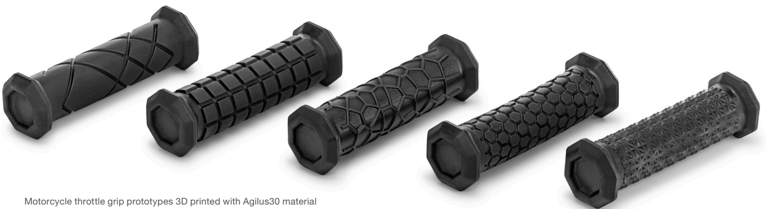
Motorcycle throttle grip prototypes 3D printed with Agilus30 material

With the J850 Pro, it's simple to create functional, multimaterial models that let you test and validate prototypes faster, and move through stakeholder review with ease. This leads to quicker decisions and approvals, helping you achieve product verification, increase throughput and save valuable time.