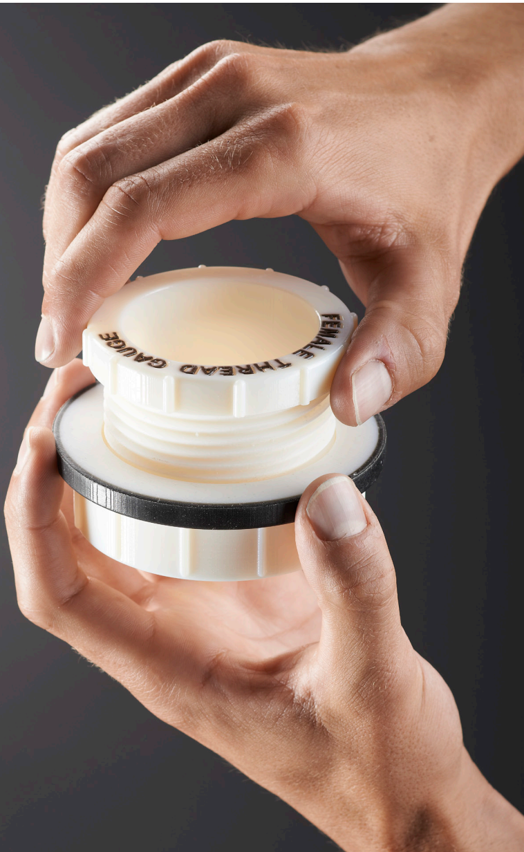
Threaded gauge prototype with male and female components

Use the Agilus30™ material family to create flexible parts and prototypes that can flex, bend, elongate and seal.