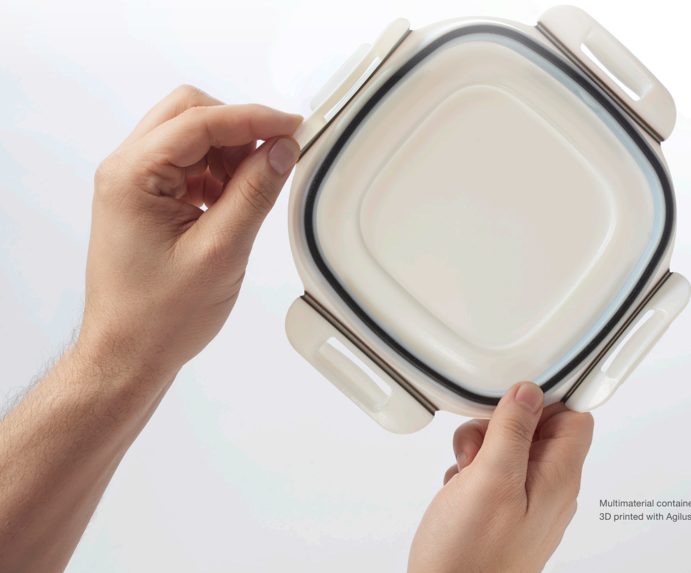
Multimaterial container lid prototype 3D printed with Agilus30 material

And if you need full-color capabilities down the line, the J850 Pro can be upgraded to meet those needs.