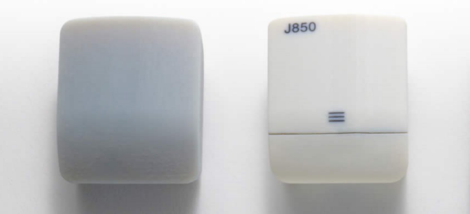
Earbud case prototypes 3D printed with DraftGrey (left) and VeroPureWhite (right)