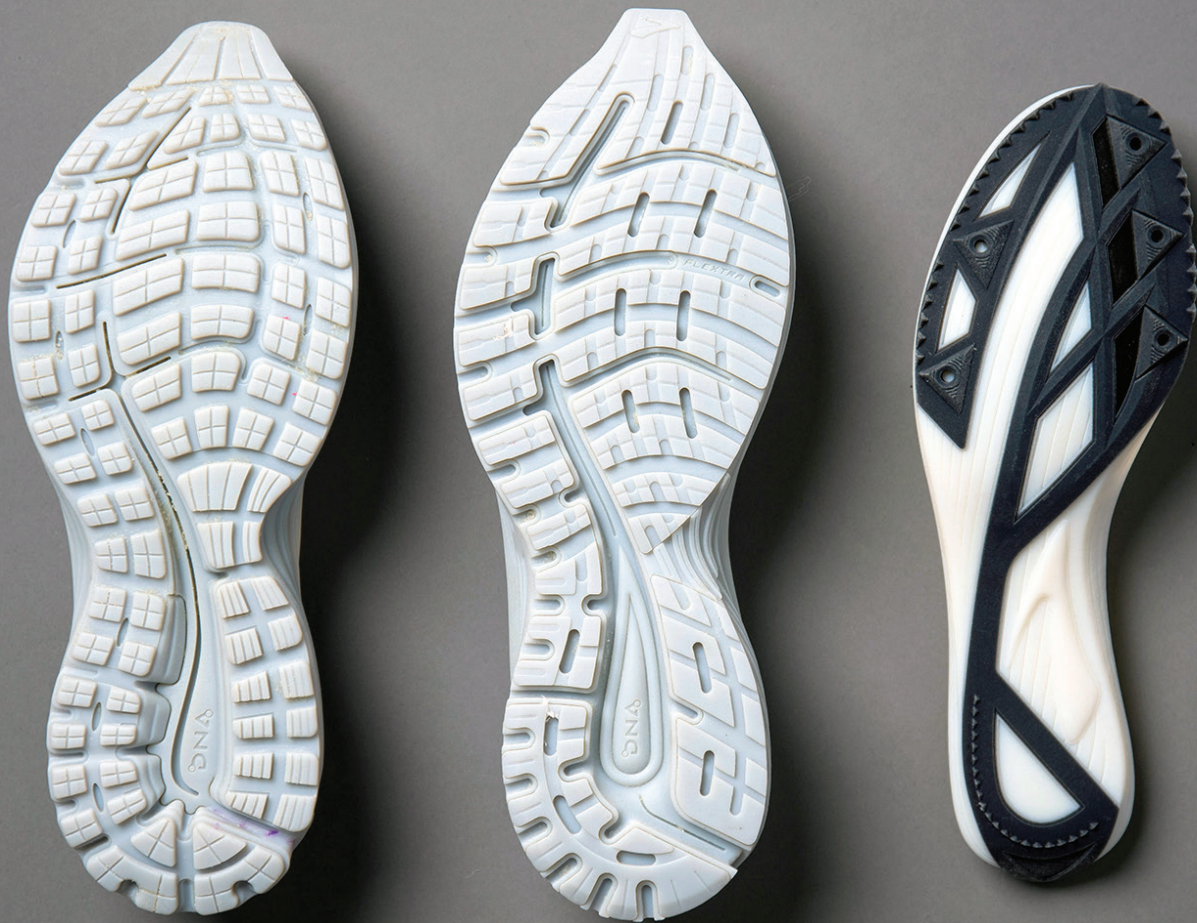
3D printed shoe midsole and outsole prototypes created by Brooks Running